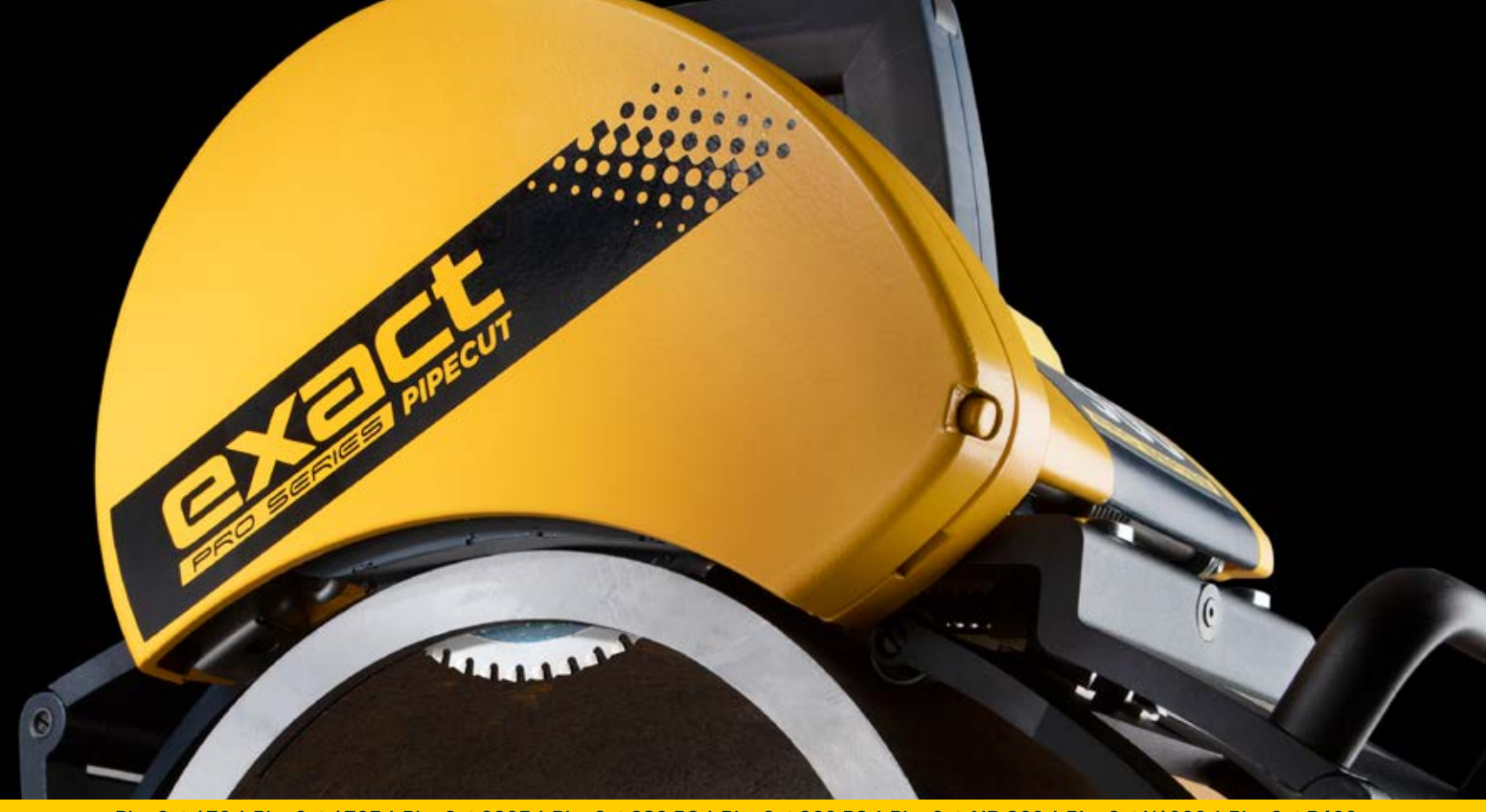
PipeCut 170 | PipeCut 170E | PipeCut 220E | PipeCut 280 PS | PipeCut 360 PS | PipeCut AIR 360 | PipeCut V1000 | PipeCut P400